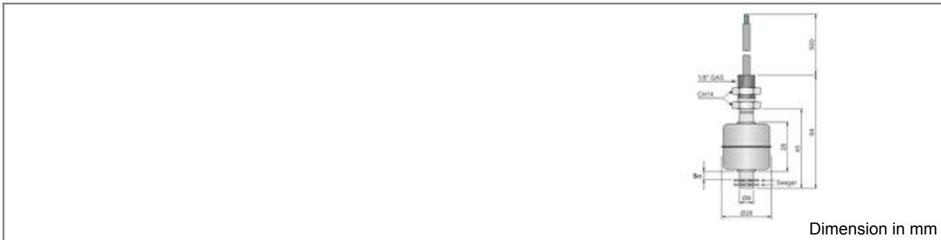
Dimension in mm

Part number: SLM000002 - Model: SLM-08 NO GM1