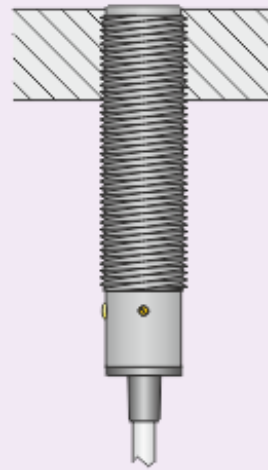
Montaggio a filo